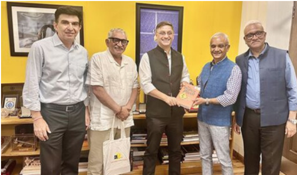
Meeting with Sanjeev Sanyal , Member of Prime Minister's Economic Advisory Council