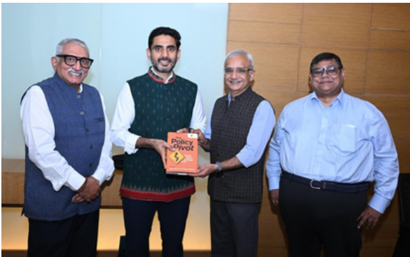
Meeting with Lokesh Nara , Minister of IT, Electronics & Communication, and Human Resources Development and RTG , Government of Andhra Pradesh