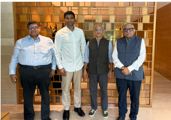
Meeting with Sri Krishna Devarayalu Lavu , Member of Parliament, TDP.