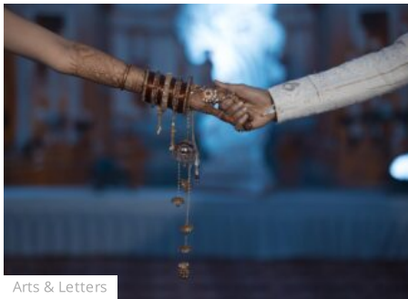
Arts & Letters