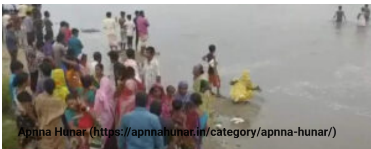
Apnna Hunar ( https://apnnahunar.in/category/apnna-hunar/ )

🕒 6 mins ago admin ( https://apnnahunar.in/author/admin/ )