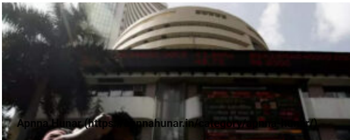
Apnna Hunar ( https://apnnahunar.in/category/apnna-hunar/ )

( https://apnnahunar.in/indices-inventory-marketplace-replace-nifty-financial-institution-index-falls-0-67/ ) Indices: Inventory Marketplace Replace: Nifty Financial Institution Index Falls 0.67% ( https://apnnahunar.in/indices-inventory-marketplace-replace-nifty-financial-institution-index-falls-0-67/ )