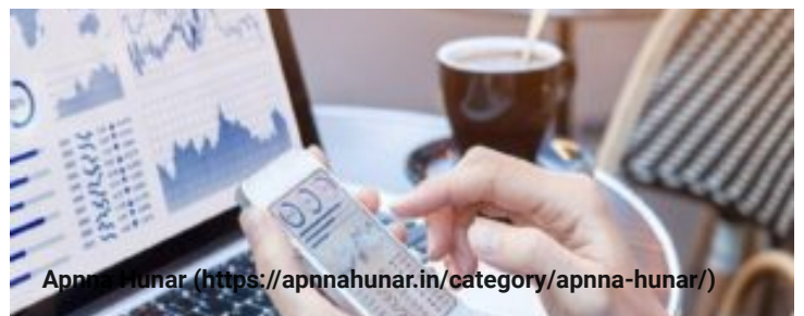
Apnna Hunar ( https://apnnahunar.in/category/apnna-hunar/ )

🕒 8 mins ago admin ( https://apnnahunar.in/author/admin/ )