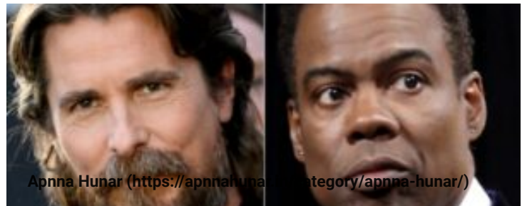
Apnna Hunar ( https://apnnahunar.in/category/apnna-hunar/ )

🕒 3 mins ago admin ( https://apnnahunar.in/author/admin/ )