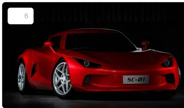
mobility. Xiaomi-backed Chinese EV startup China Car Custom unveils Ferrari-inspired electric sports car SC01: IN PICS