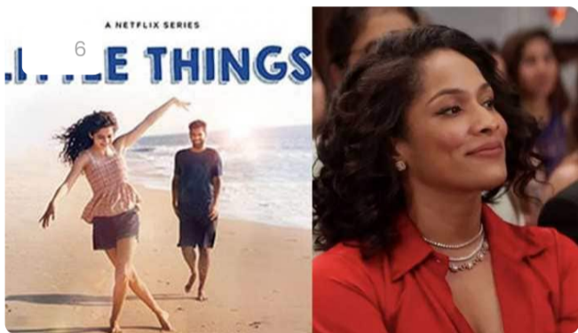
World Tourism Day 2022: Masaba Masaba Season 2 to Little Things, these Netflix shows and films will make you wanna travel the world!