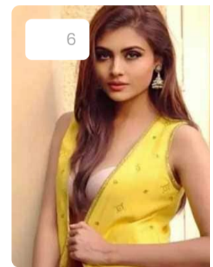
Sports Deepak Chahar's sister DEBUT: Know all about her