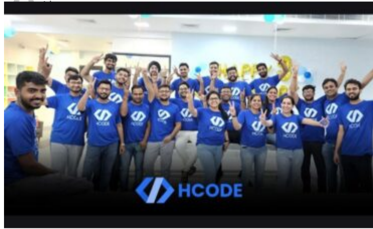
An IT Company By IITians In Karnal Takes Their Team To Thailand