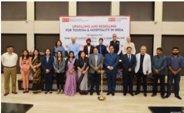
BCCM Launches Mentoring Club To Support And Enhance Skilling.