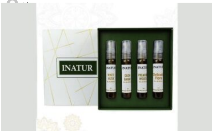
Festive Gifting Guide For Beauty Lovers