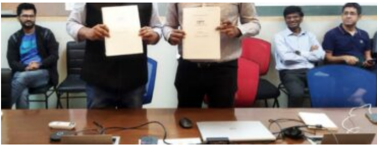
EGovernments Foundation Partners With IIT Madras Alumni Association