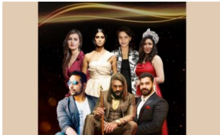
The Stage Is Set For A Star-Studded Mrs. Karnataka 2022 – Event In Bangalore!