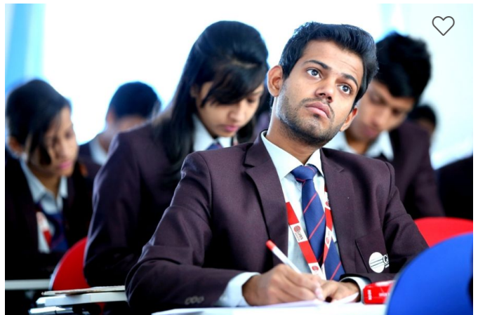
GIBS Bangalore proudly launched the IRE, Finishing School & Marketing Lab for Batch 2022