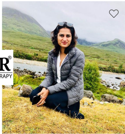
At Inatur, natural is exquisite. Inatur Is For Everyone