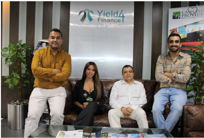
Yield Group of Companies Received AA Rating By 2 International Rating Agencies