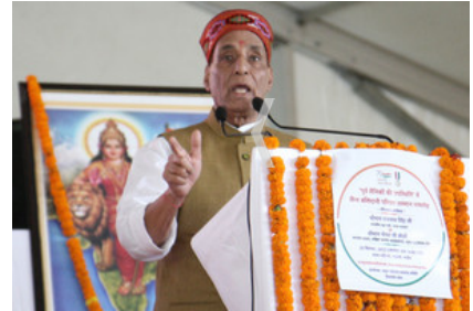
BADOLI, SEP 26 (UNI):- Union Minister for Defence, Rajnath Singh addressing the gathering during the felicitation of the families of the Armed Forces personnel who laid down